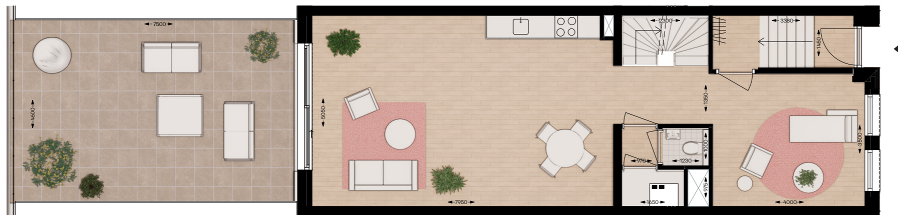
Begane grond 71,3 m 2